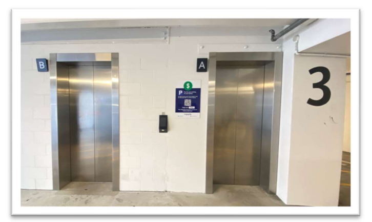
lifts located on level 3 of the parking complex.

Let us know if you have any questions or if you're not able to find the car park.